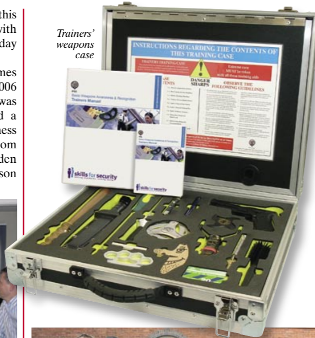
Trainers' weapons case

Regardless of how much sophisticated electronic detection equipment your personnel have at their disposal, if they don't know what they are looking for they won't find it. A lack of basic awareness and weapons recognition will result in security breaches.