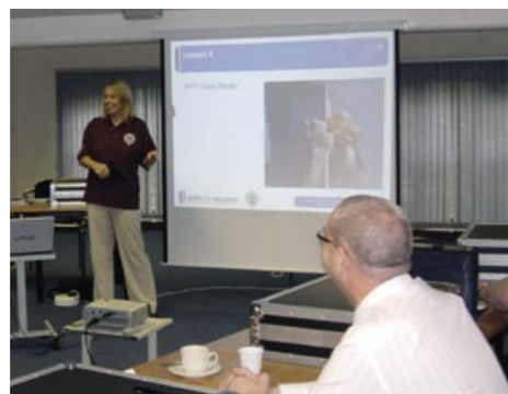
Debs delivering the 2nd Weapons Awareness course

The course received a very positive reaction and all the delegates without exception felt that it was an extremely informative and well designed course. Delegates viewed the course as a balanced mix of theory and practice and were impressed with the purpose built weapons training case designed by PS5 that they took away with them at the end of the course. Here at Skills for Security, we are delighted with the positive feedback that we have received regarding this innovative new training course. With the number of crimes involving knives, firearms and imitation firearms reportedly increasing we at Skills for Security firmly believe that it is our duty to equip our sector's trainers and their students with sufficient knowledge to recognise weapons concealment and respond to any weapons related incidents in a calm professional and safe manner. We feel that the new Basic Weapons Awareness & Recognition Programme addresses this need and we feel sure that this will become an invaluable programme for anybody working in the sector.