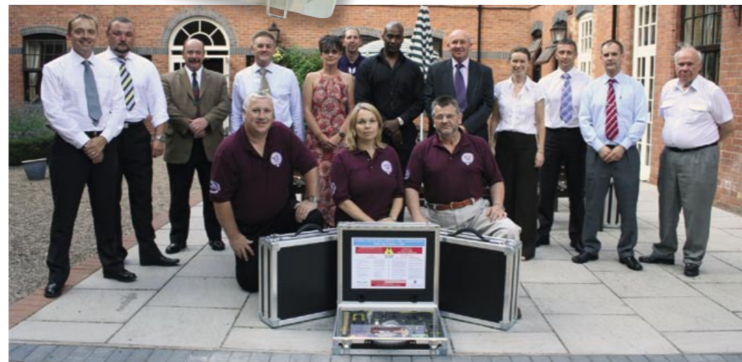
The PS5 Training Team with the all the delegates of the very first Basic Weapons Awareness Training Course

Regardless of how much sophisticated electronic detection equipment your personnel have at their disposal, if they don't know what they are looking for they won't find it. A lack of basic awareness and weapons recognition will result in security breaches.